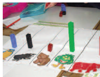
Left: Image 4, Children constructing a concrete graph Above: Images 5 and 6, Graphs constructed by groups